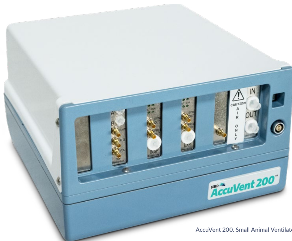
Accuvent 200. Small Animal Ventilator.

The AccuVent offers increased change response performance for inspiration, peak inspiration and expiratory pressure times, through the use of fast switching controller valves. Users can expect respiratory rates up to 30Hz and a maximum breath rate of 1800 BPM.